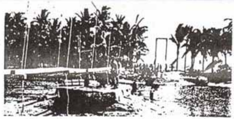
Engineers Working on the Suspension Footbridge

equipment and extricate itself from the beach, a messize was radioed to Qui Nhon requesting LCU's be sent up the coast to complete the mission.