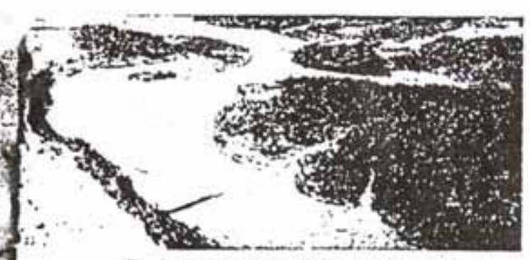
The Beach, Long Bailey Bridge, and Causeway